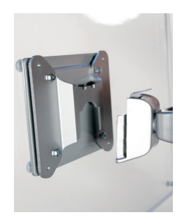
VESA quick release