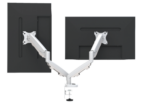
Monitors can pivot from portrait to landscape orientation easily. Arms have wide range of motion.