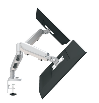
VESA mounts tilt up and down, providing a flat writing surface for touch screen monitors