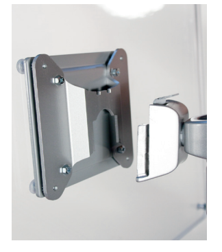
VESA quick release