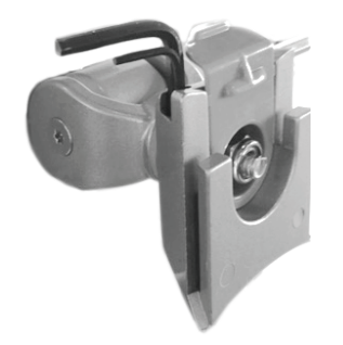
integrated allen key storage