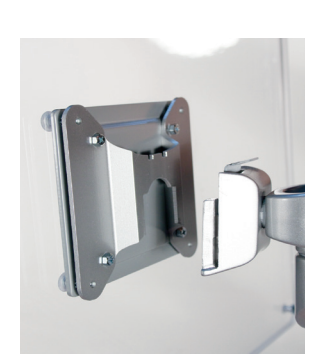
VESA quick release