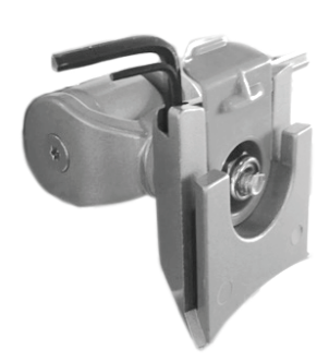
integrated allen key storage