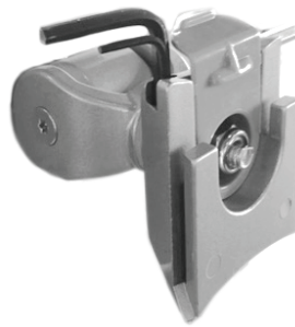
integrated allen key storage