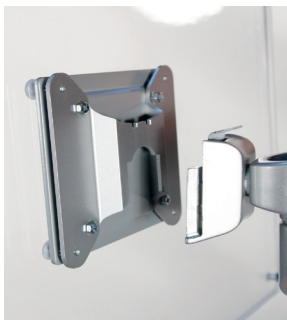
VESA quick release