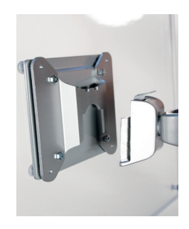
VESA quick release