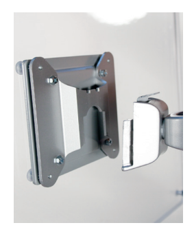
VESA quick release