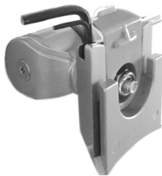
integrated allen key storage