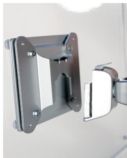
VESA quick release