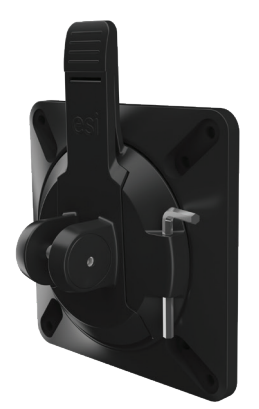
integrated tool storage