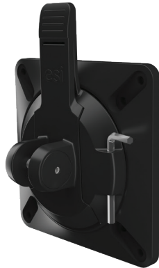
integrated tool storage